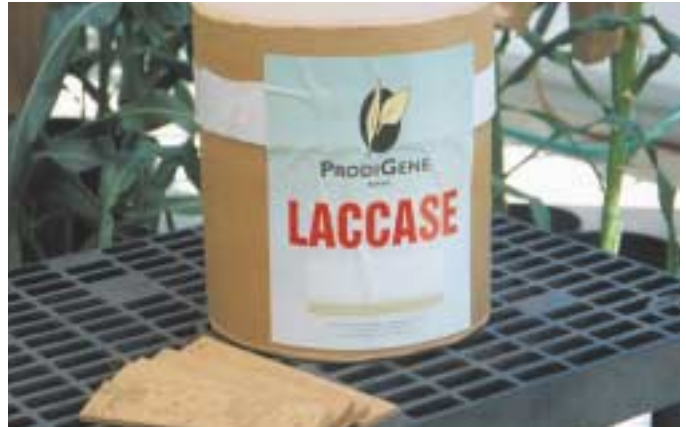
Medium density fiberboard made with ProdiGene's Laccase.

We've produced a broad range of proteins including monoclonal antibodies, vaccines, enzymes, binding proteins and structural proteins. This is not just talk...we've produced these products. We've done it and no one else has.