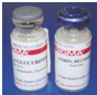
Avidin and Aprotinin from our transgenic corn

To read the complete press release visit www.staufferseeds.com